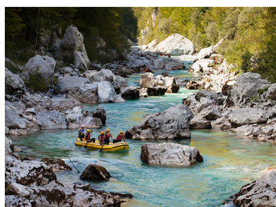
WATER ACTIVITIES IN SLOVENIA

Outstanding nature , which creates a perfect natural playground, is also the reason, why Slovenia is the homeland to so many top athletes, among them also Olympic medallist Benjamin Savšek , and a top host of global sports events, such as the 2023 ICF Canoe Slalom World Cup Ljubljana-Tacen ❤️.