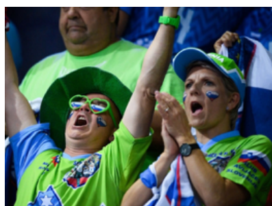
SLOVENIA HAS A SPORTING HEART