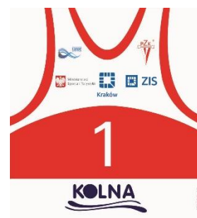
WC1 – Junior