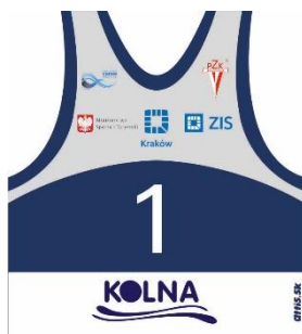
MC1 – Under 23