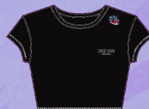
CROC TOP 22€