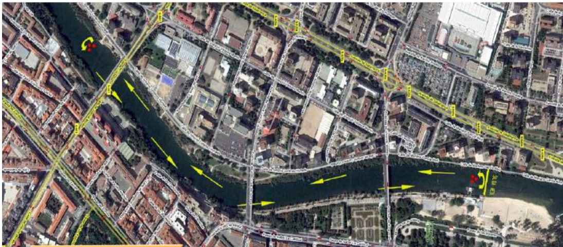
Pisuerga River Valladolid 5.000m: 2 turns over