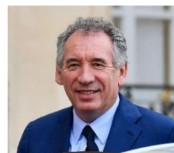
François BAYROU, Mayor of Pau