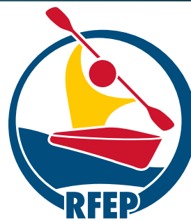
Real Federación Española de Piragüismo