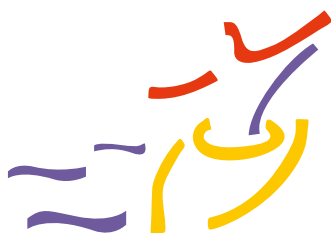
Federación de Piragüismo de Castilla y León