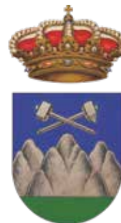
Ayuntamiento de Sabero