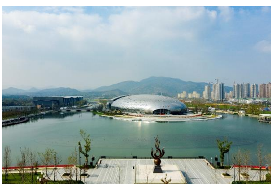
ICF CANOE POLO WORLD CHAMPIONSHIPS 2024 皮艇球世界锦标赛

It is the first time since Japan 2004 that the world's has returned to Asia and the second time for a real city centre venue.