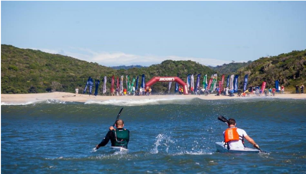
The beautiful Yellow Sands finish