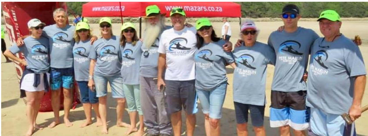
Our trustworthy volunteers