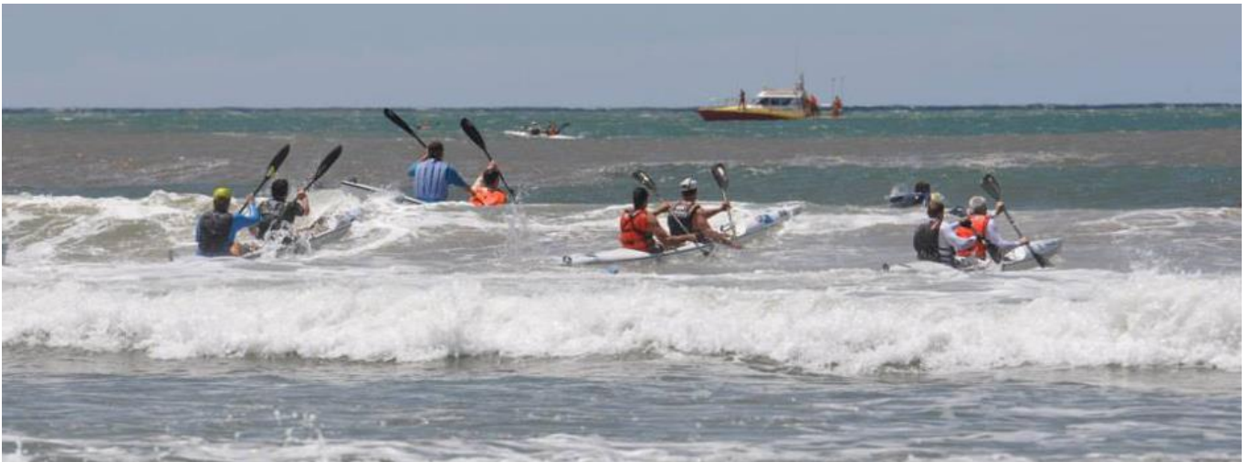
NSRI ensuring that all paddlers are safe

Cell phone in a pouch, CSA approved PFD, Leg leash, preferably bright colour clothing/cap and ski decals, CSA number on ski