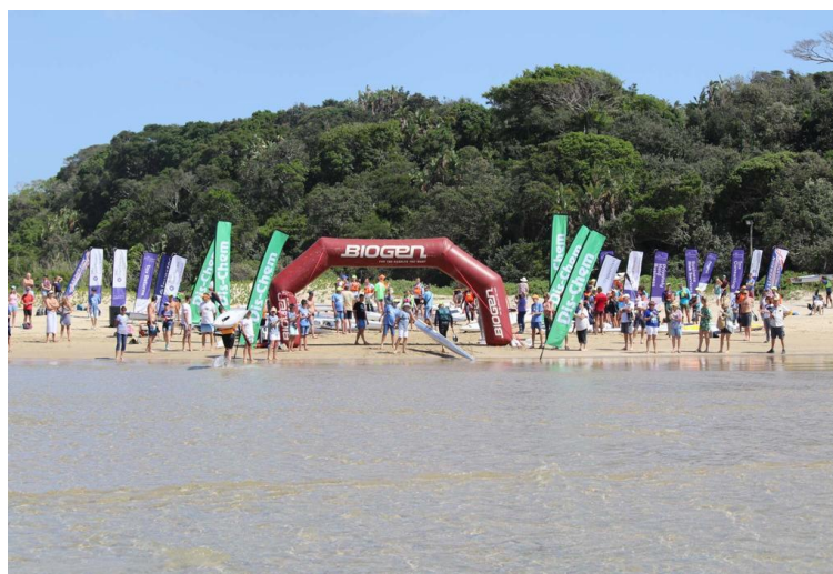
A beautiful finish destination