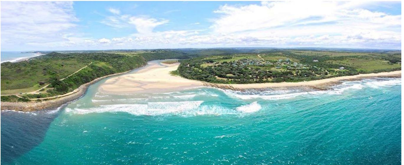
Aerial footage of Yellow Sands

Please ensure that your correct cell phone number is provided on your race entry to ensure you receive these notifications.