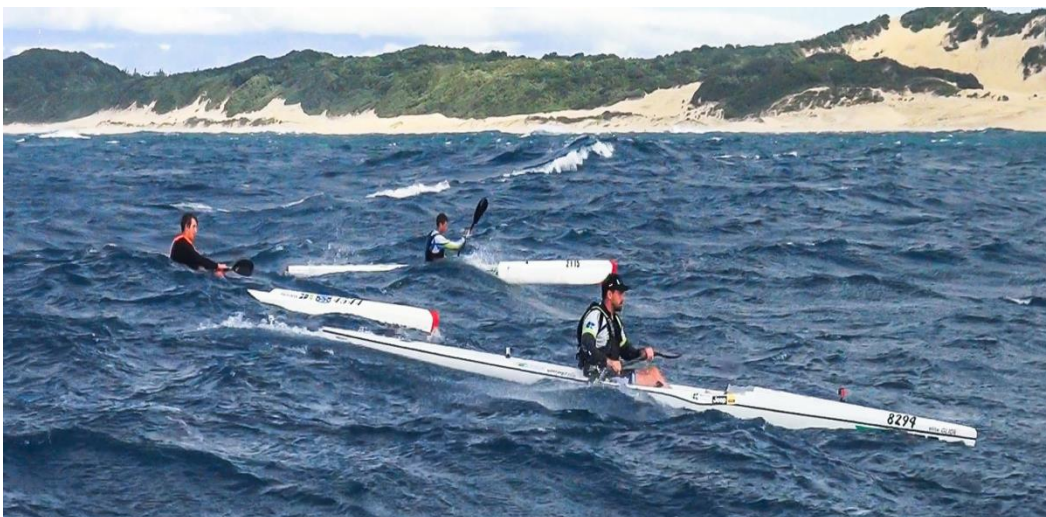
Paddlers enjoying a magnificent downwind