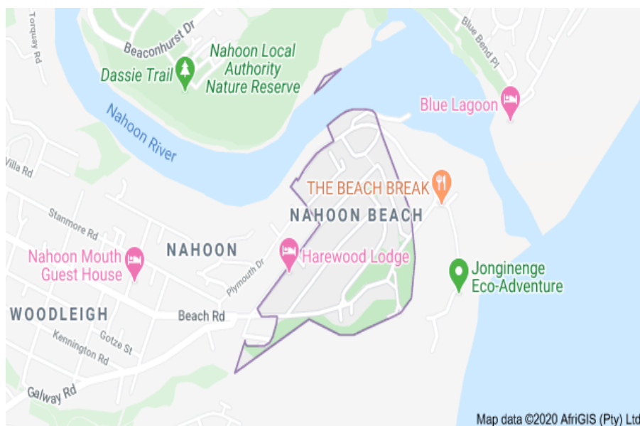
Map of Nahoon

The primary location for most activities is the Nahoon Beach, staying close to this location would be advantageous.