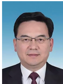
Sheng Yuechun, Mayor of Shaoxing