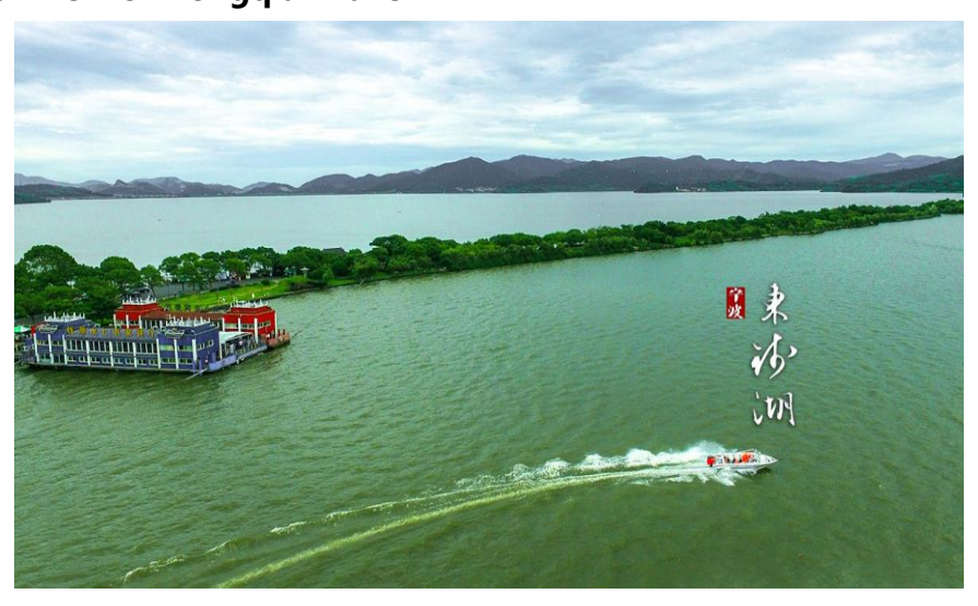
Page 7 of 22