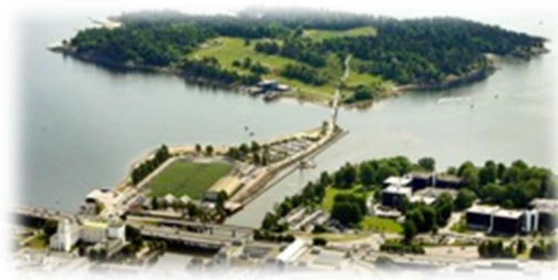
Kadettangen (before they made the new extended park) and Kalvøya