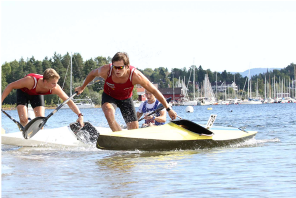
Disembarkment at Kadettangen