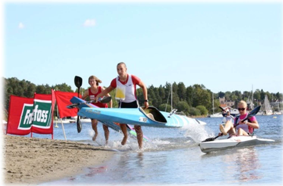
Portage at Kadettangen during Norwegian Championships

The area for start, portage and finish at Kadettangen. The hotel indicated is the Thon Hotel Oslofjord, our official hotel, walking distance to the venue.