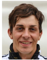
Sideris Tasiadis C1M - GER